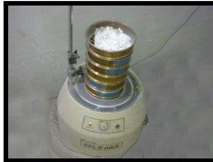
Figure (4): Electrical sifting device

allowed to pass the powder ( P \leq 250 \mu\text{m} ), will be passed and used in this study. This powder have a wide of distribution of powder particles size standard 250 \mu\text{m} , containing down to the size less than 250 \mu\text{m} , which is related to the characteristic behavior of burning investment and the efficiency of grinding unit as well as sieving unit.