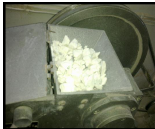
Figure (3): Electrical grinding device

In this study the pumice used was fine grade type and the investment material after burning it was get it after completed the casting procedure of crown & bridge in dental lab. The investment material was mixed according to the manufacture instruction. The burning temperature which is used for burning the investment material in this study was 950°C, after burning the investment it was crushing and grinding it by using Retch. BB1 A device. As shown in figure (3).