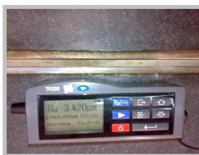
Figure (8): surface roughness tester

in three different directions for a distance of 1.7 mm according to apparatus design, for each specimen two reading were recording and the mean value for each specimen was the average of the reading. The data was collected and subjected to statistical analysis.