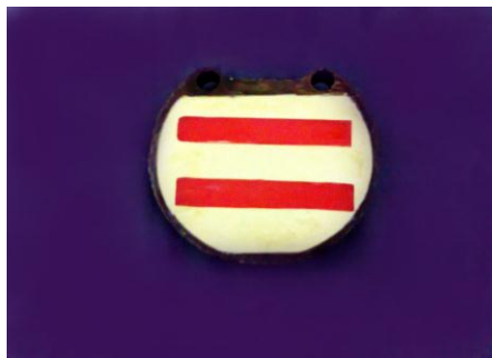
Figure (1): The flask

(grades 120 to 40µm) with continuous water cooling, each acrylic plate was cut into equal square plates with an acrylic separating disk to obtain the final measurement of 10x10x2.5 mm(length, width, thickness ) (8) as shown in figure(2). All the tested specimens were conditioned in distilled water at 37C° before they were tested according to ADA specification NO.12 (1999).