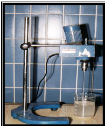
Figure (5): Mechanical mixture

The glass funnel and filter paper were used in the filtering process, figure (6). The process was done by pouring the suspension slowly, the clay was kept over filter paper and water with soluble content is thrown to the glass beaker through glass funnel. Then the clay was collected in dish and put it in oven for dryness at 100C for 2 hours (8) . The dry powder are milled for 1 hours and sieved by the same sieving technique that used for burning investment to get powder having particle size range \leq 250\mu\text{m} .