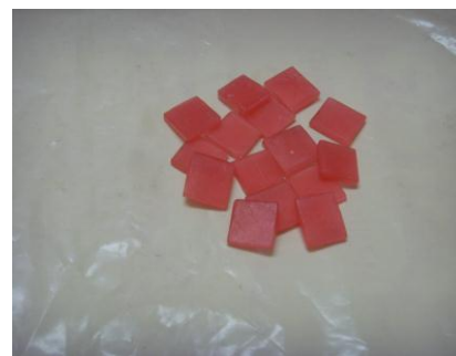
Figure (2): The acrylic plates