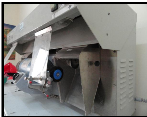
Figure (7): Acrylic specimen fixed on polishing dental lathe device

for each specimen was 2 min. The amount of water added to each of these polishing materials (pumice, burning investment, and black sand) was 2ml measured by using plastic disposable syringe.