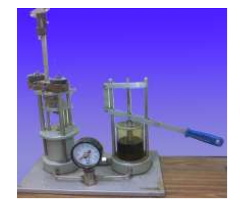
Fig (4) compressive strength testing machine

C=F/A C: compressive strength F: force A: area