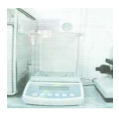
Fig (2) electronic digit balance

Alginate was hand mixing for time recommended by manufacturer which was controlled by a timer, and the method was kept almost constant with all mixing. Initially, the mixing was done slowly so that the alginate powder was thoroughly wetted and non of the powder lost from the bowl. It was then followed by energetic 2 spatulation when the material was worked against the side of the bowl. Until homogenous mixture was obtained, then placed immediately inside the mold until the material has exuded on the top of the mold, a flat glass was pressed on the top of the mold to remove the excess material(11).Fig(3).